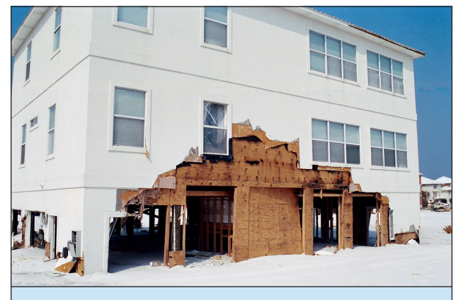
Figure 4. Building siding extended down and over the breakaway wall. Lack of a clean separation allowed damage to spread upward as the breakaway wall failed.