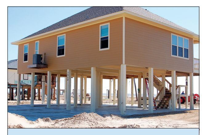
Figure 2. Breakaway walls beneath this building failed as intended under the flood forces of Hurricane Ike.

flood and that the elevated portion of the building and its foundation will not be subject to collapse, displacement, or lateral movement under simultaneous wind and water loads. Breakaway walls must break away cleanly and must not damage the