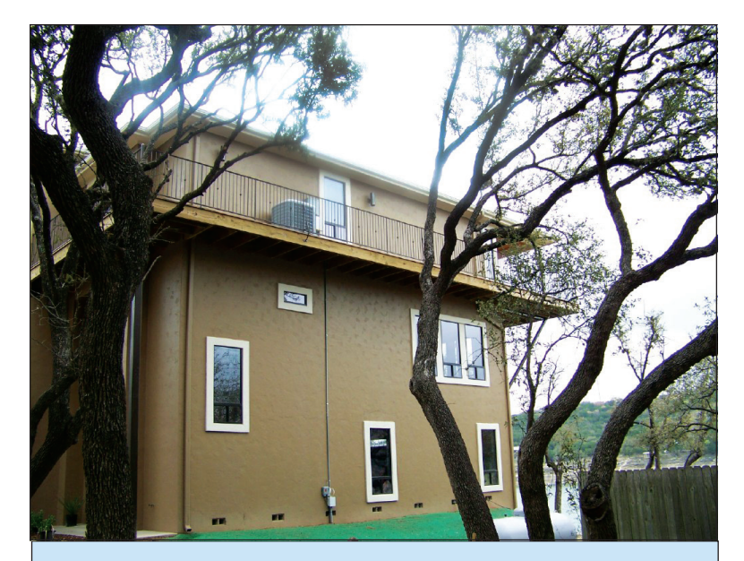
Figure 7. Example of a two-story enclosure below the BFE. This type of enclosure presents special construction and flood insurance issues. Contractors should proceed with caution when an owner requests such an enclosure.

Two-story enclosures below elevated buildings (see Figure 7). As some BFEs are established higher and higher above ground, some owners have constructed two-story solid wall enclosures below the elevated building, with the upper enclosure having a floor system approximately midway between the ground and the elevated building. These types of enclosures present unique problems. In A Zones both levels of the enclosure must have flood openings in the walls unless there is some way to relieve water pressure through the floor system between the upper and lower enclosures; in V Zones, the enclosure walls (and possibly enclosure floor systems) must be breakaway; special ingress and egress code requirements may be a factor; these enclosures may result in substantially higher flood insurance premiums.