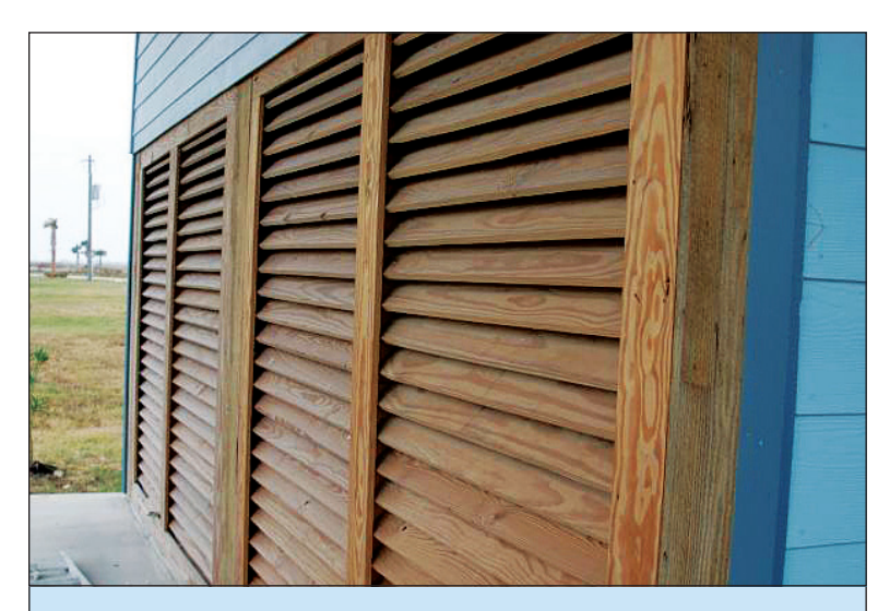
Figure 1. Wood louvers installed beneath an elevated house in a V Zone are a good alternative to solid breakaway walls.