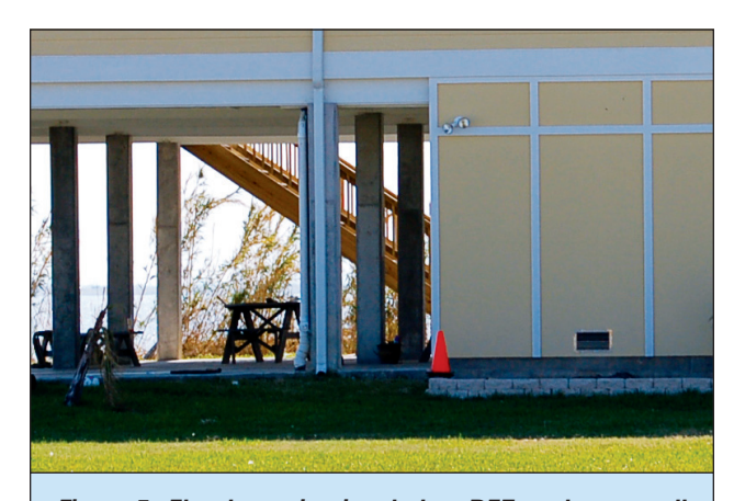
Figure 5. Flood opening in a below-BFE enclosure wall.

Details concerning flood openings can be found in FEMA (2008c) Technical Bulletin 1-08, Openings in Foundation Walls and Walls of Enclosures .