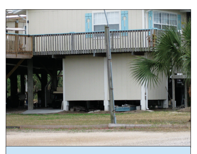
Figure 6. Example of an enclosure that does not extend to grade. This type of enclosure presents special construction and flood insurance issues. Contractors should proceed with caution when an owner requests such an enclosure.

Below-BFE enclosures that do not extend all the way to the ground (sometimes called "hanging" enclosures or "elevated" enclosures, occurs when there is an enclosure floor system tied to the building foundation and above the ground see Figure 6). In V Zones, the enclosure walls must be breakaway, and the enclosure floor system must either break away or the building foundation must be designed to accommodate flood loads transferred from the enclosure floor system to the foundation. In V Zones, the enclosure walls must be breakaway, and the enclosure floor system must either break away or the building foundation must be designed to accommodate flood loads transferred from the enclosure floor system to the foundation.